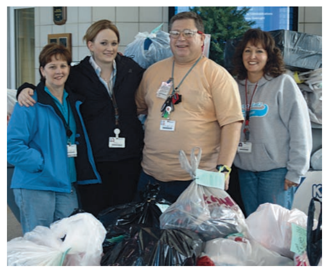
Each year, Calvert Cliffs' employees work with the Calvert County Department of Social Services to provide gifts for needy children through the Tree of Angels program.

In addition to caring for the community, the Constellation Energy team at Calvert Cliffs takes pride in caring for the environment, holding a 30-year record of environmental responsibility. Constellation Energy manages more than 2,000 acres of pristine forest and shoreline at Calvert Cliffs, with only 380 acres used for facilities.