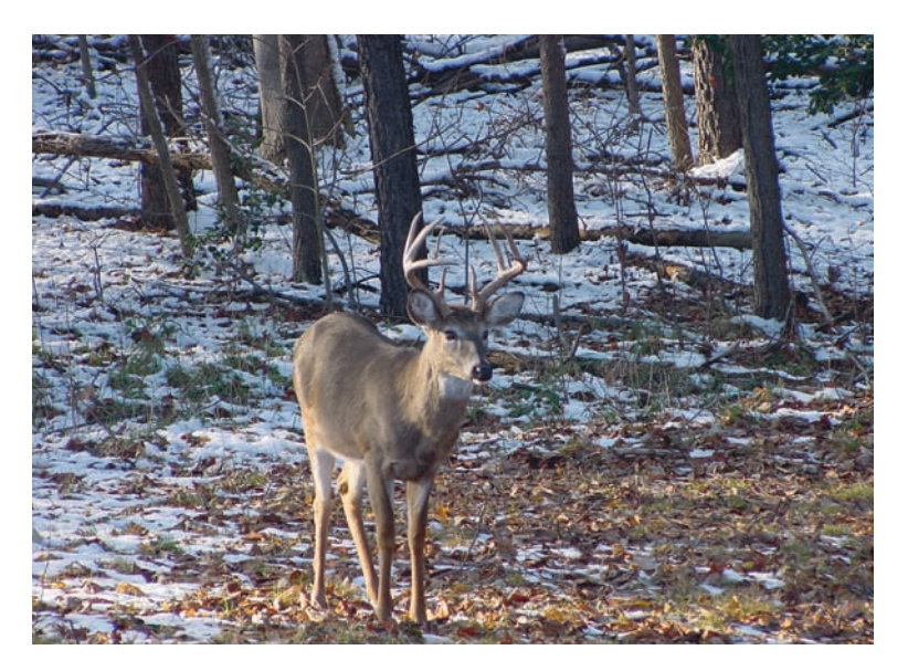
Constellation Energy monitors more than 700 deer that make their home at Calvert Cliffs.

Sciences plant disease-resistant oysters to help the Chesapeake Bay oyster population. Constellation Energy's environmental program at Calvert Cliffs attracts national attention. The Wildlife Habitat Council began recognizing Calvert Cliffs as a certified site in 1993, and in 2002, honored the plant with a fifth biannual certification. In 2001, Calvert Cliffs also received state-wide recognition with the Maryland Community Forest Council's PLANT award for tree planting and maintenance initiatives. In 2004, Calvert Cliffs was certified as a Maryland Tree Farm for the site's excellent forestry management practices.