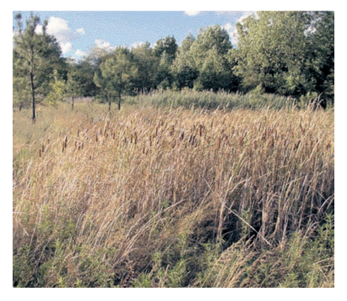
Staff at Calvert Cliffs created wetlands to support the health of the Cheasapeake Bay.

The nuclear fuel used at Calvert Cliffs and at all nuclear power plants differs significantly from uranium used in nuclear weapons. Nuclear energy fuel uses only about four percent fissionable uranium, whereas a nuclear weapon uses 100 percent fissionable uranium. Because of this difference, nuclear power plants cannot explode.